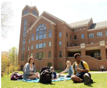
Students: Pages 3 – 20