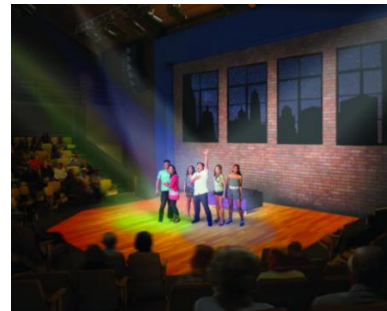
Visitors: Page 31